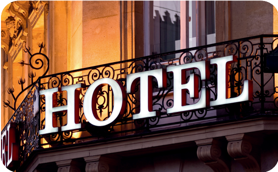
Hotel & Property