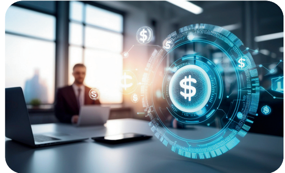
Media & Technology